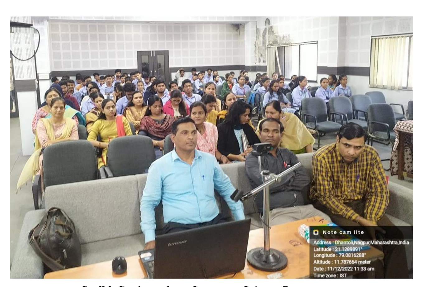
Staff & Students from Computer Science Department