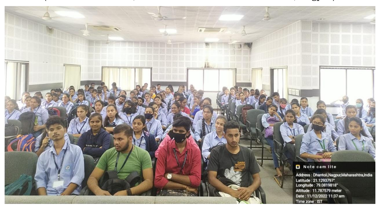
Students from Computer Science Department