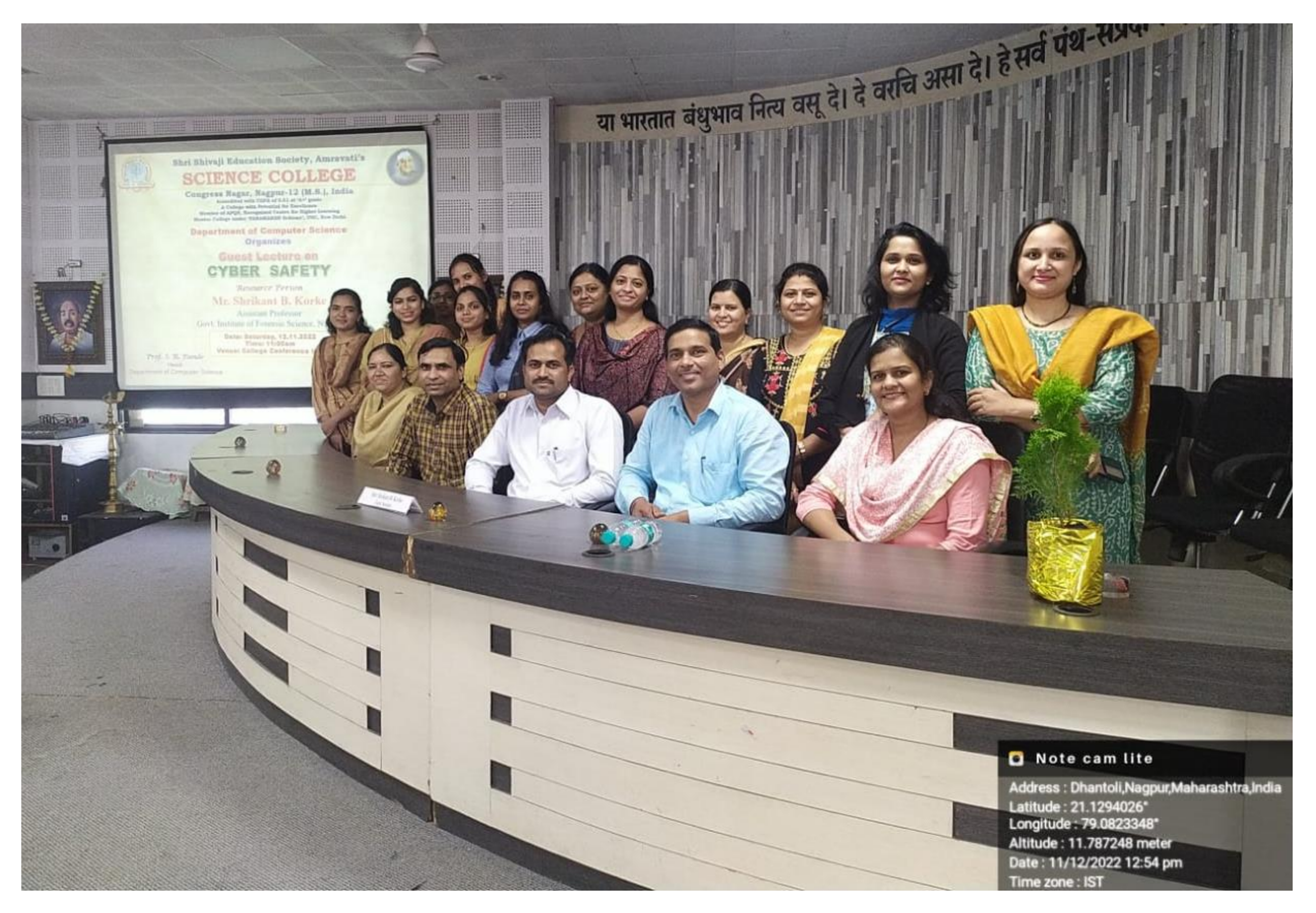
Group Photo: Staff Members of Computer Science Department with Guest Speaker