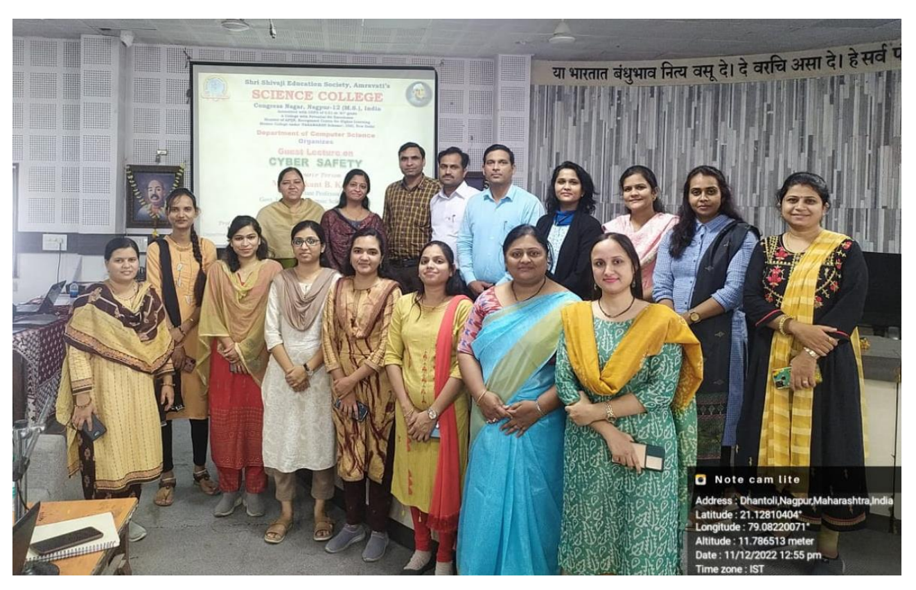
Group Photo: Staff Members of Computer Science Department with Guest Speaker