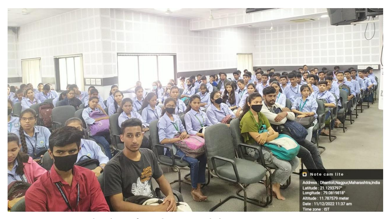
Students from Computer Science Department